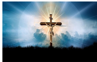
“Blotting out the handwriting of ordinances that was against us, which was contrary to us, and took it out of the way, nailing it to his cross.” (Col. 2:14)

Calvary over two thousand years ago, all our sins and their byproducts (i.e. everything under “the curse of the law” - e.g. see Deuteronomy 28:15-67) were crucified together with Him. Like the scapegoat in Leviticus 16:21-22, Jesus took our sins far away from us! Colossians 2:14 says that Jesus blot-